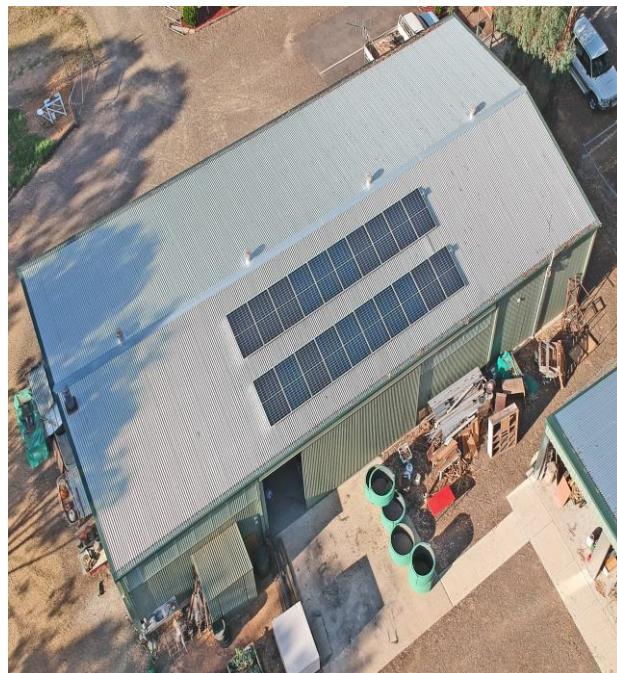
Aerial view of the solar panels

Nathalia Men's Shed has received a grant from the Foundation for Rural and Regional Renewal (FRRR), to install 5kW of solar panels on the roof of our shed.