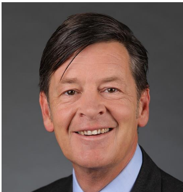
Honourable Luke Donnellan MP, Minister for Child Protection, Disability, Ageing and Carers