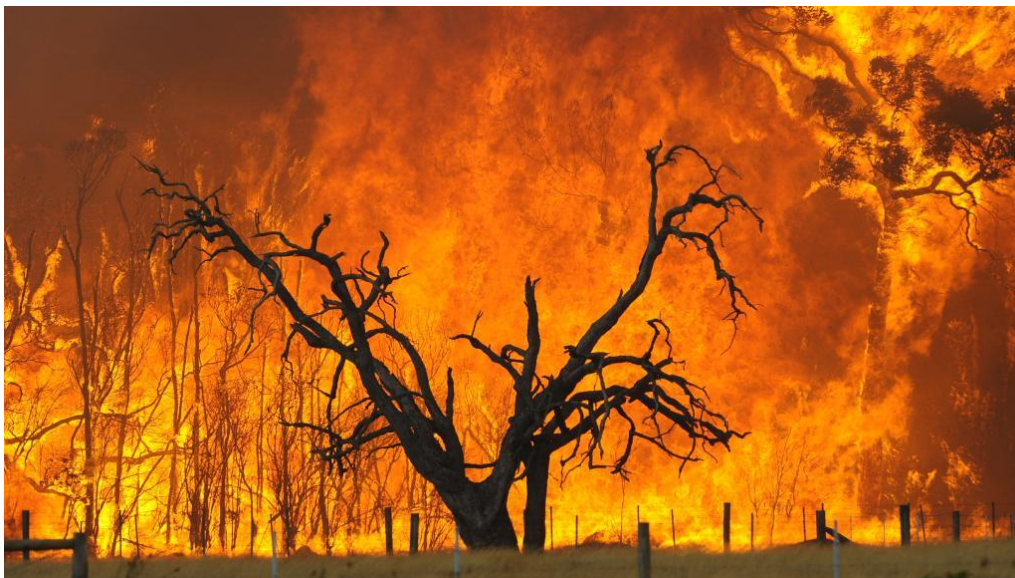
File Picture of bushfire in Victoria

The VMSA is committing itself to this long-term recovery project and has issued a bulletin for all of its members and stakeholders. The VMSA will keep everyone informed and will be seeking assistance from sheds, shedders and stakeholders.