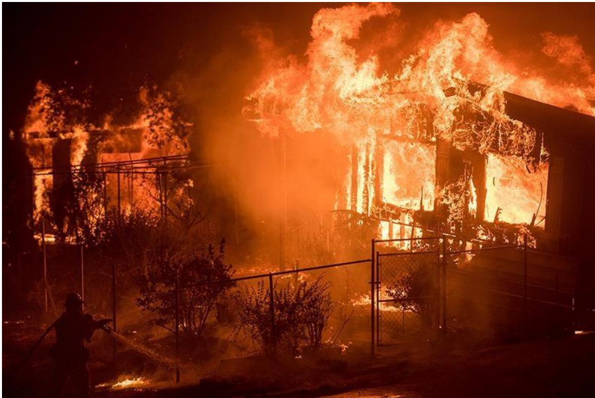
File Picture of bushfire in Victoria

To find out more about how to apply for an EMERGENCY PAYMENT in Victoria visit the Australian Governments Victorian Bushfires webpage . You can also call 180 22 66 .