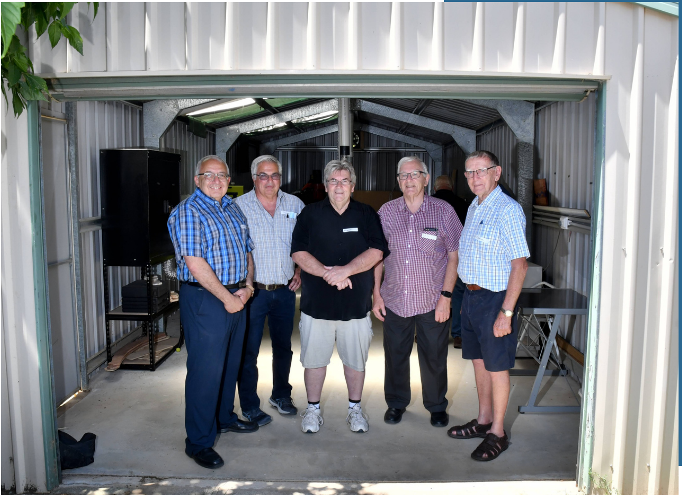
Emu Creek Men's Shed.