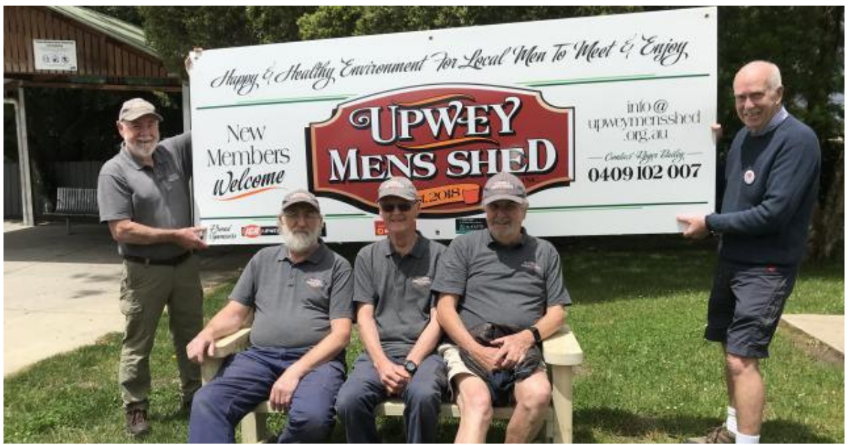
The Upwey Men's Shed four-year search for a permanent home is set to end.

After four years of searching and dead-ends, the Upwey Men's Shed has signed a licensing agreement with a local high school to relocate to its premise.