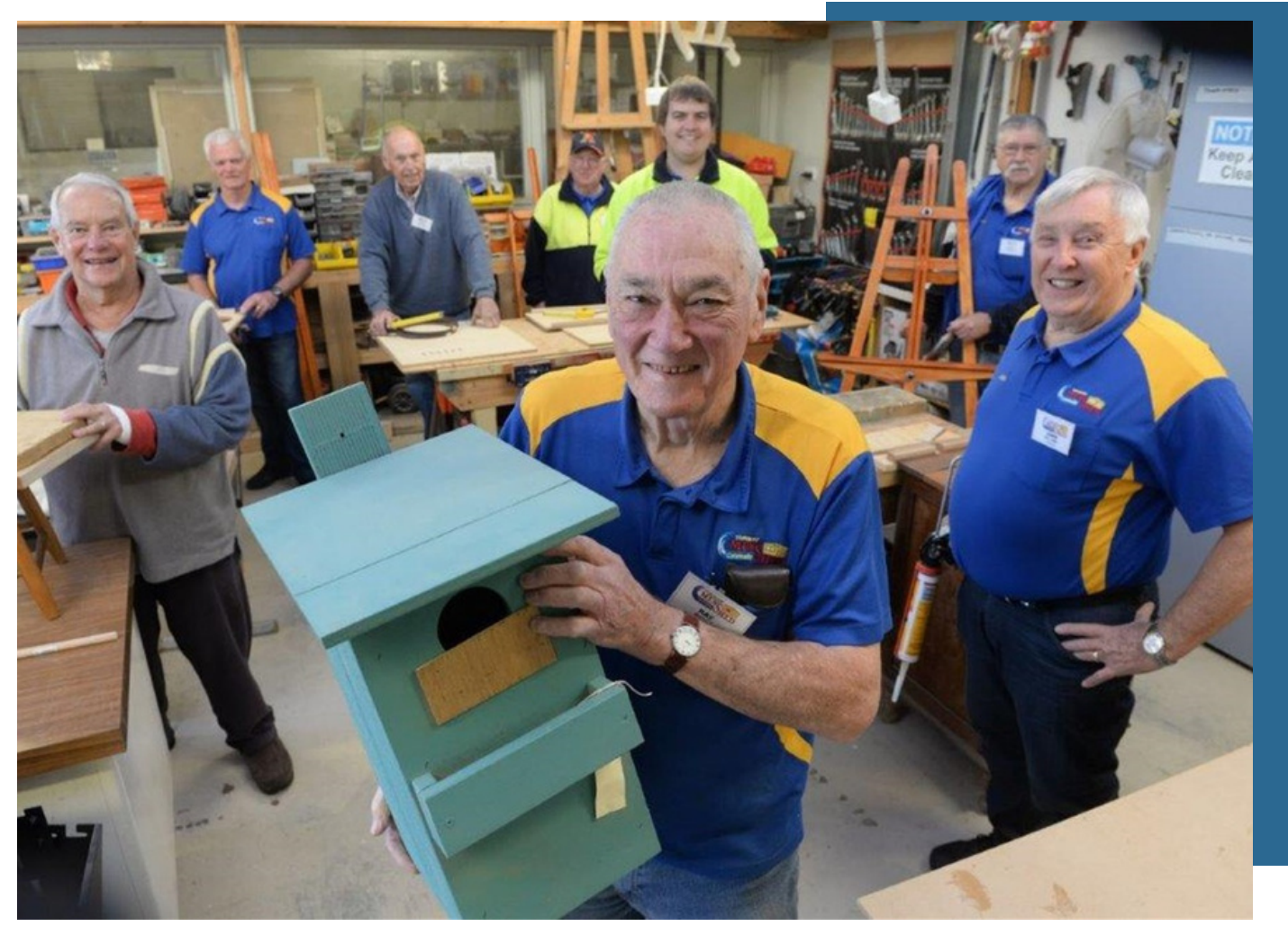
Torquay men's shed showing off their craftsmanship