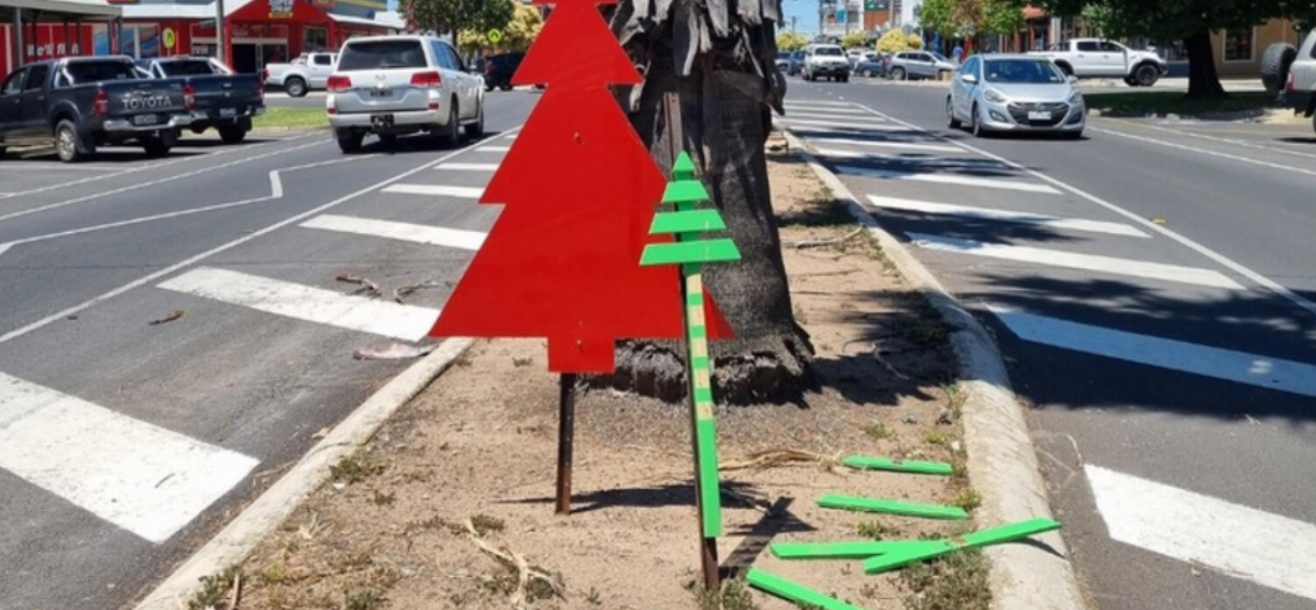
Photographs of just some of the damage done to wooden Christmas trees produced to brighten Belmore Street at Christmas time.

Damage and theft of some Christmas decorations from Belmore Street, Yarrawonga at the start of 2023 has infuriated local residents.