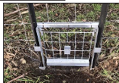
Above: Wombat swing gates are easy to install and should be placed on well-used wombat tracks. Installation is simple and instructions are provided. Once installed, it is best to tie the gate up for a couple of weeks so the wombats slowly get used to the change in the fence. The gate is then lowered.