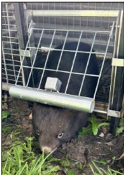
Leading on from the successful Victorian Wombat Gate trial we are pleased to announce that wombat swing gates will now be available to landowners in NSW.

Wombat swing gates help to solve farmer-wombat conflict